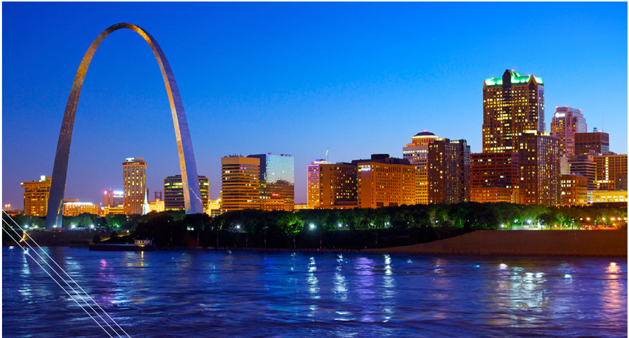
ST. LOUIS SKYLINE